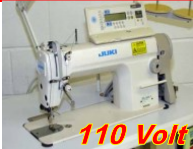
Juki Model DDL-8700-7 Single Needle, Full Auto, 110v