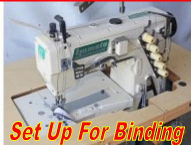
Yamato Model VF-2504 Flatbed Cover Stitch