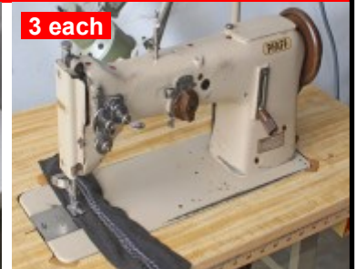
PFAFF Model 138 Single Needle, 1 Step Zig Zag