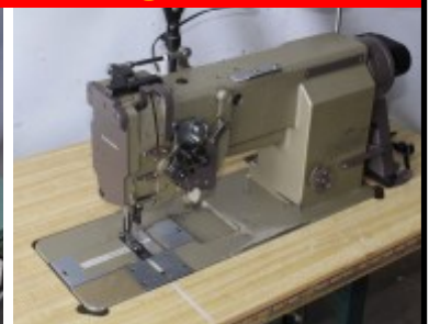
Mitsubishi Model LT2-240 2 Ndl, Split Needle, 1/8" ga