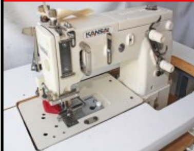
K.S. Model DLR-1501 SN, Chain Stitch, w/ Puller