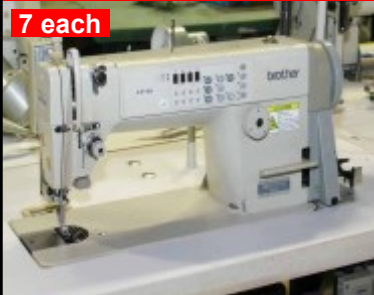
Brother Model SL-B737 Single Needle, Full Auto