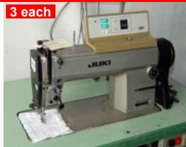
Juki Model DLN-5410-6 SN, Needle Feed, Full Auto