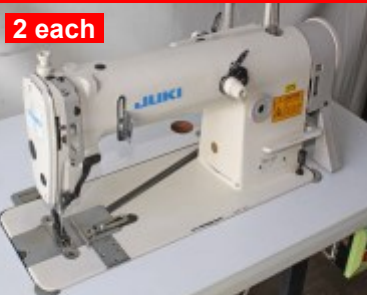
Juki Model MH-481 Single Needle Chain Stitch