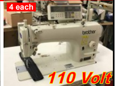
Brother Model S-7200C SN, Full Auto, 110 volt