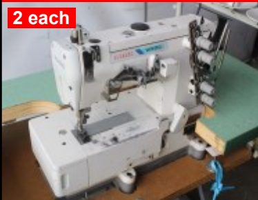
Pegasus Model W562 Flatbed Cover Stitch