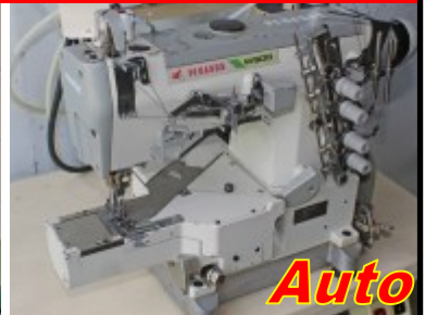
Pegasus Model W664 3-Needle Cylinder Cover Stitch