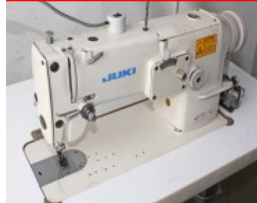
Juki Model LZ-586 Single Needle, 1 Step Zig Zag