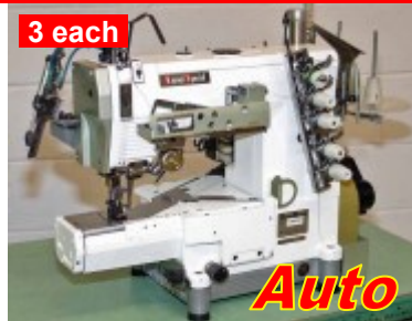
K.S. Model RX9803 3 Needle Cylinder Cover Stitch