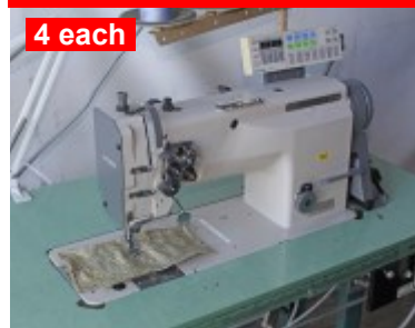
Mitsubishi Model LT2-2230 2 Ndl, 1/4" Gauge, Full Auto