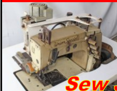
U.S. Model 56500 2 Ndl, 1/4" Gauge, w/ Puller