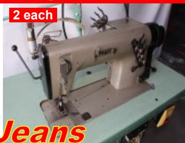
PFAFF Model 704 3 Ndl Chain Stitch w/ Puller